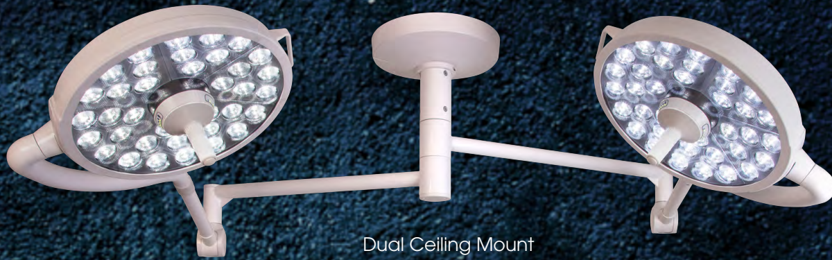
Dual Ceiling Mount