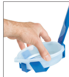
Just push cup in