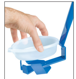
Lift cup out