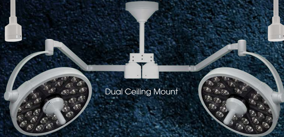
Dual Ceiling Mount