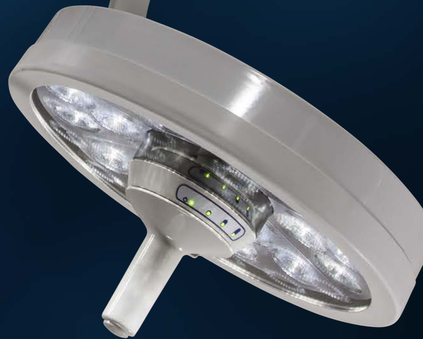
MI-750 Dual Mounts