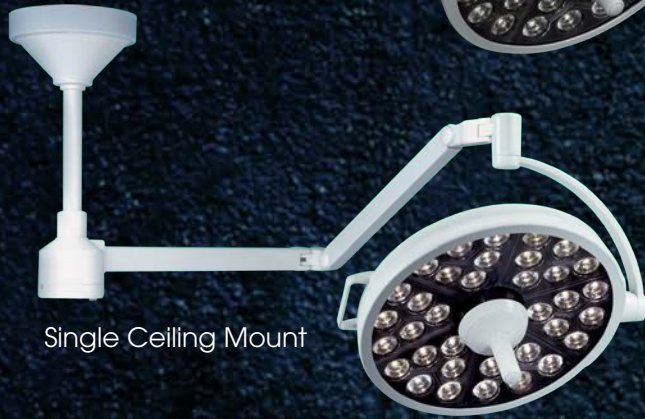
Single Ceiling Mount